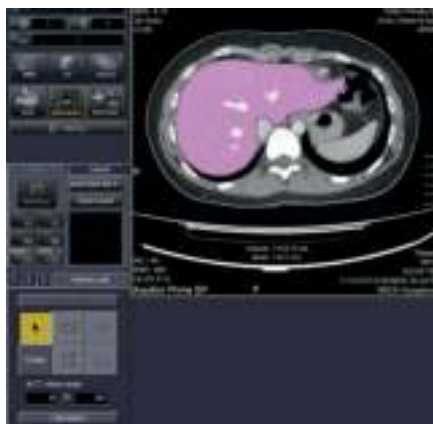
Figure 1. Calculation of the volume of the liver by the standard method. The maximum density threshold is 180 HU

On each axial scan, the outline of the liver was drawn manually with the mouse cursor using the pencil tool. The inferior vena cava, portal vein with major branches, and gallbladder were excluded from the ROI. Total liver volume and residual liver volume were obtained by summing the volume at each section. To determine the volume of the liver without vessels, an allowable density threshold was set in the toolbar, which corresponded to the density of the liver, thus the volume of vessels was excluded. The minimum threshold was 30 HU., the maximum varied based on the density of each liver. The program changed the coverage intensity of the isolated liver parenchyma based on the given density. Thus, the maximum density threshold was set, which covered the entire liver parenchyma without blood vessels. The results were saved as a screenshot (Figure 1).