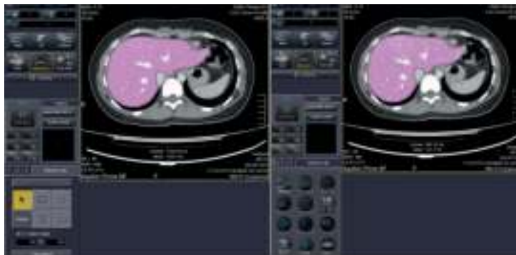
Figure 2. Calculation of the liver volume by the optimized method. Maximum density threshold a) 170 HU b) 160 HU

were also excluded from the study area. For optimization, we changed the allowable density threshold. The minimum remained the same 30 HU. For the optimization method, we lowered the maximum density threshold by 10 HU and by 20 HU. The results obtained were saved as a screenshot (Figure 2).